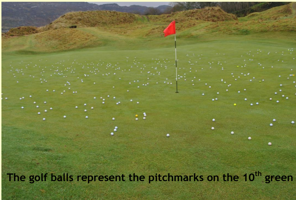
The golf balls represent the pitchmarks on the 10 th green

Repairing a pitch mark takes seconds, but leaving it can take weeks to heal. A repaired pitch mark will heal in less than 24 hours. However leaving it or repairing it the wrong way can take up to 3 weeks to recover. A pitch mark can cause the indentation to the green surface, which will affect the roll of the ball.